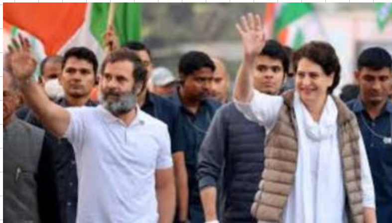
Rahul Gandhi with Prinyaka Gandhi at Bharat Jodo Yatra