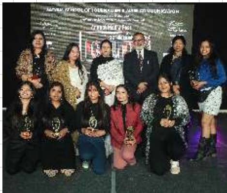
Student core co-ordinators of Ignite 2022