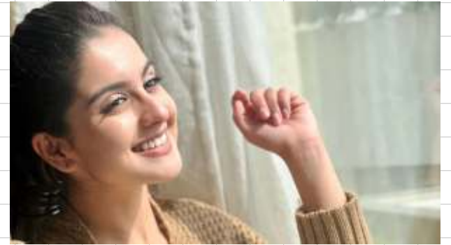
TV actress Tunisha Sharma

It's heartbreaking when anyone decides that life is too painful to bear. The suicide of a young person is especially agonizing for those left behind; just when it seems, at least from the outside, that life could take you anywhere and make you anything you want to be, suicide slams every window and locks every door.