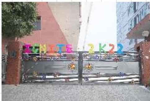
Satyam Group of Institutions' gate decoration at IGNITE 2K22