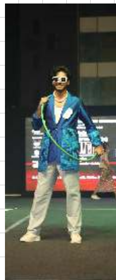
Participant of Fashion Walk