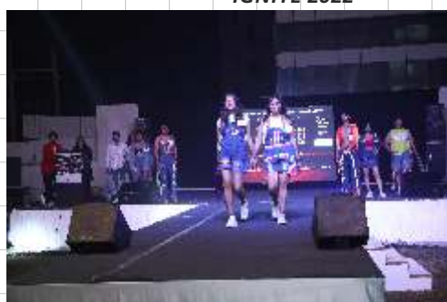
Fashion Walk : Walk with pride