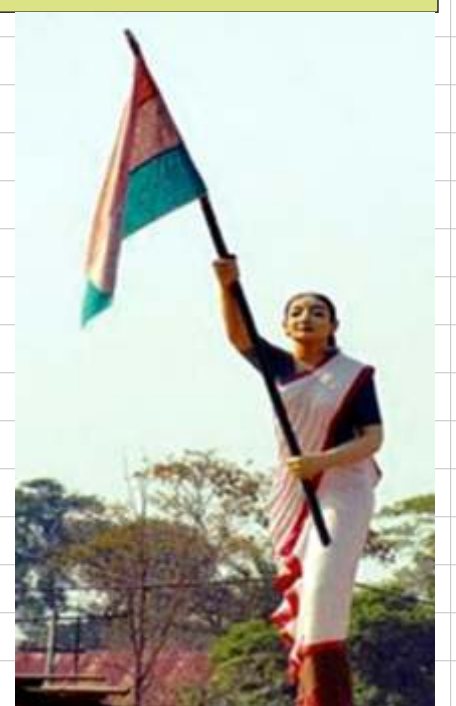
Freedom Fighter kanak Lata Barua

Barua was shot dead by the Indian Imperial Police of British Raj while leading a procession hoisting the tricolour Indian flag during the Quit India Movement. Well, there are plenty of freedom fighters and revolutionary whose names are not applauded by the nation but they truly lived for thier motherland. In the memory of KanakLata Barua a memorial statue was made at Borngabari, Gohpur.