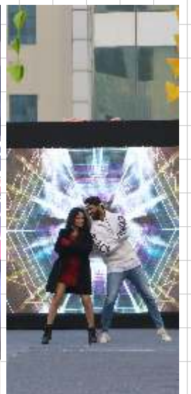
Dance performance by participants