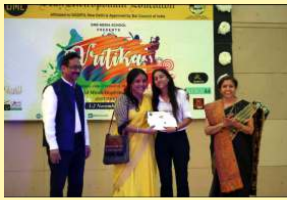
SJMC Students getting awarded at Vritika 2022 inter college competition organized by Delhi Metropolitan Education college.