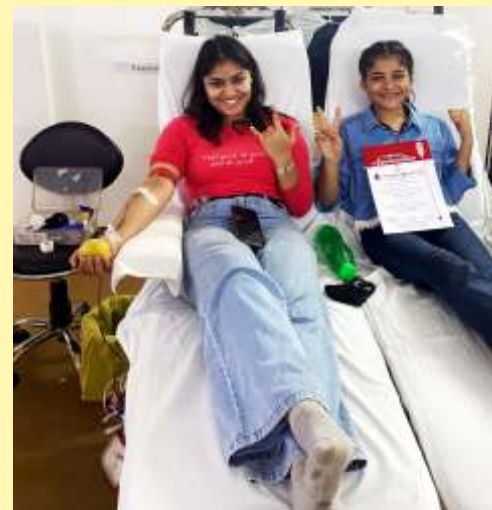
SJMC students donating blood at blood donation camp initiated by Satyam Group of Institutions.