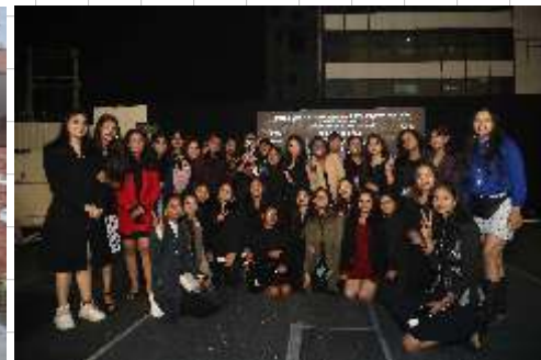
Students of SJMC at IGNITE 2K22