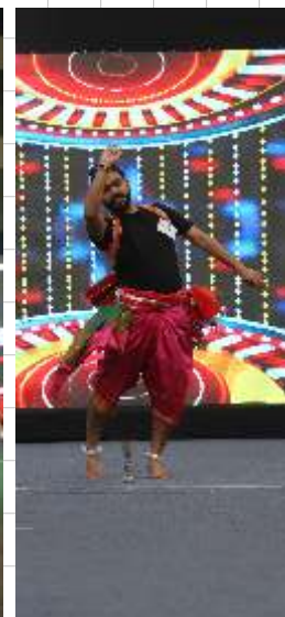
Participant performing Lavani dance