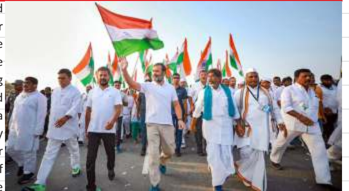
Rahul Gandhi at Bharat Jodo Yatra