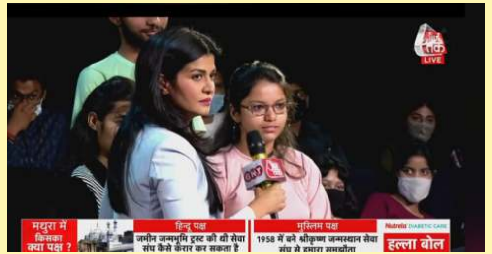
SJMC Student raising a question at Aaj Tak's Debate Show.