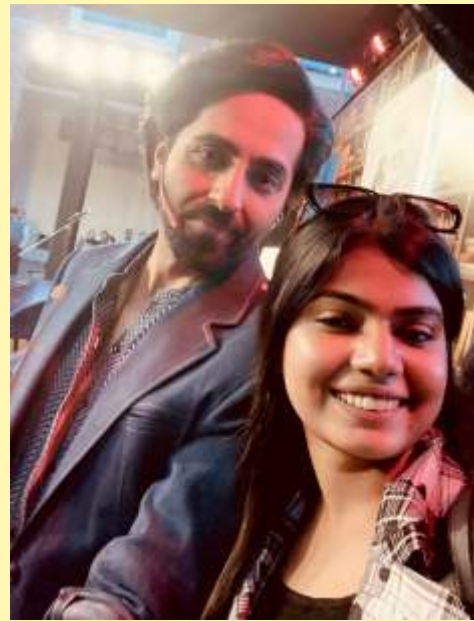
SJMC Student met a prominent actor of Bollywood Ayushman Khurrana at Sahitya Aaj Tak fest 2022.