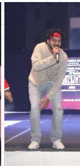
Participant of solo singing at IGNITE 2022