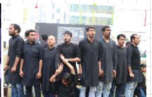
Members of Sukhmanch Theater performing at IGNITE 2K22