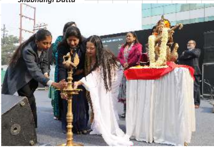
Ceremonial Lamp Lighting during inauguration of IGNITE 2K22