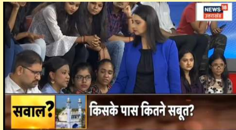
SJMC students putting up questions to leaders in the debate show organised at News Nation Channel on Gyanvapi Masjid Case.