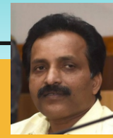
Eminent rocket scientist Somanath appointed ISRO Chairman